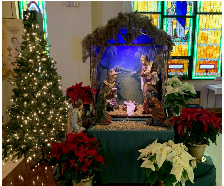
Christmas Manger Scene at BVMC Parish