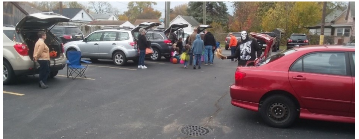
Trunk or Treat

Our first "Trunk or Treat" was held on October 30. Participants could decorate their car trunk with their favorite Halloween décor. Tables were also set up to pass out candy.