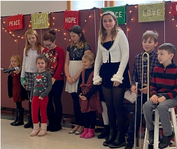
The SOCL children present a Christmas Cabaret during the parish Wigilia.

For the first time since 2019, the parish family resumed its annual Wigilia on December 18 after Holy Mass. Our SOCL Children delighted the parish with their talents in a Christmas Cabaret. The 2022 Secret Prayer Partners identified themselves to each other and new Prayer Partners were chosen for 2023.