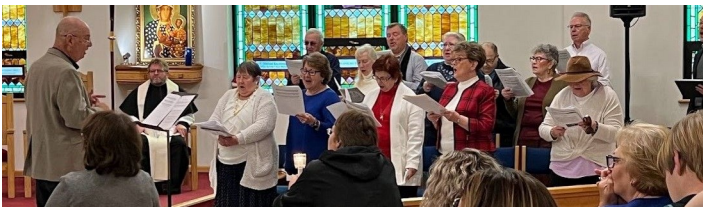
Mohawk Valley Seniorate Choir Members