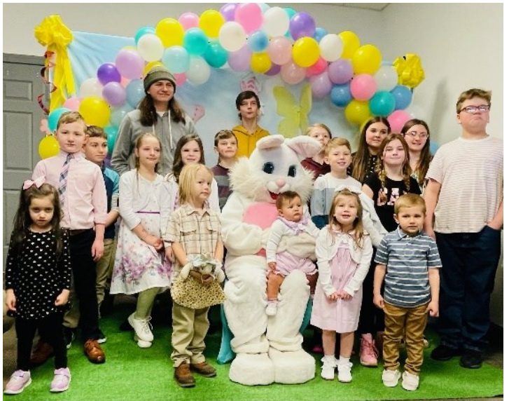
Children at Breakfast with the Bunny