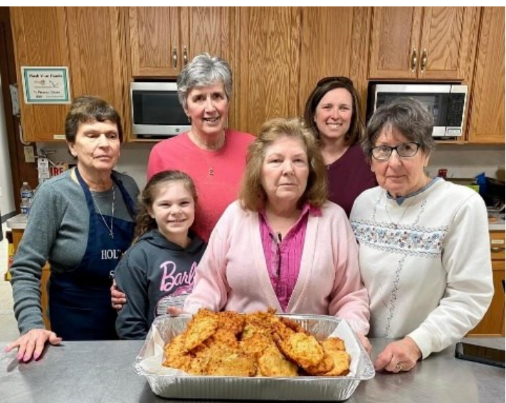
Volunteers at Lenten Potato Pancake Dinner