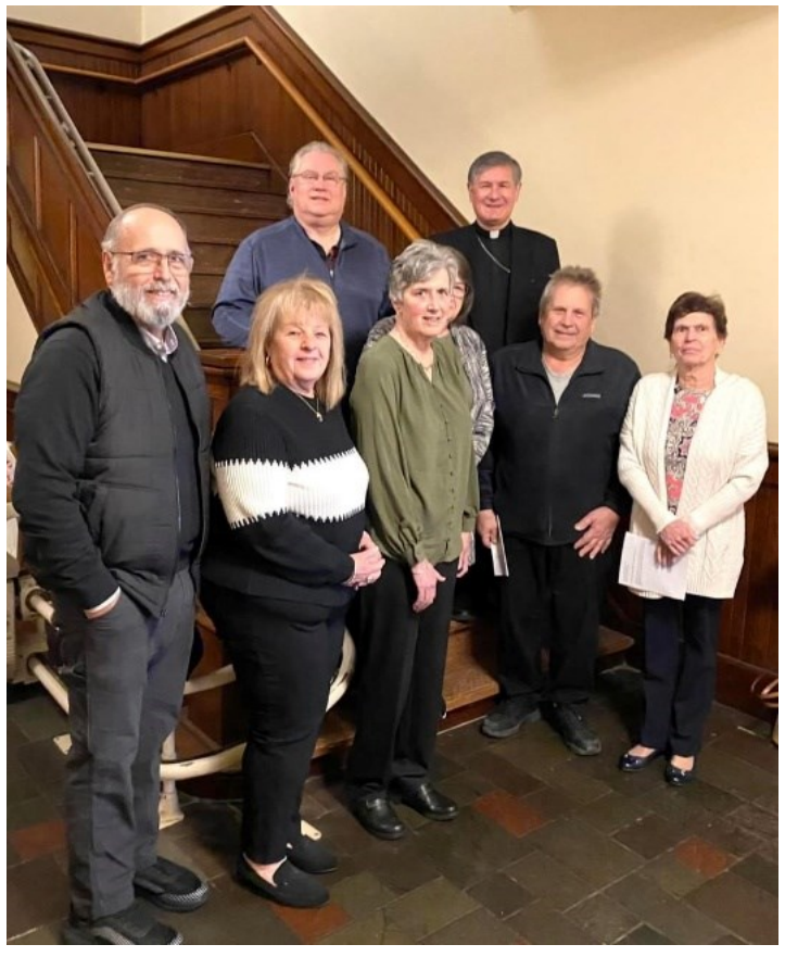
Parishioners Attending the Meal in the Upper Room at St Stanislaus Cathedral