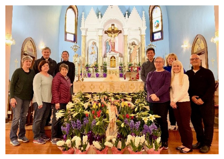
Volunteers Who Decorated the Church for Easter